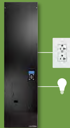
Switching panel with XP module