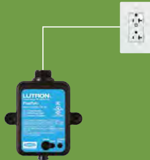
PowPak® relay module