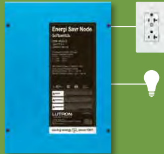
Energi Savr Node™