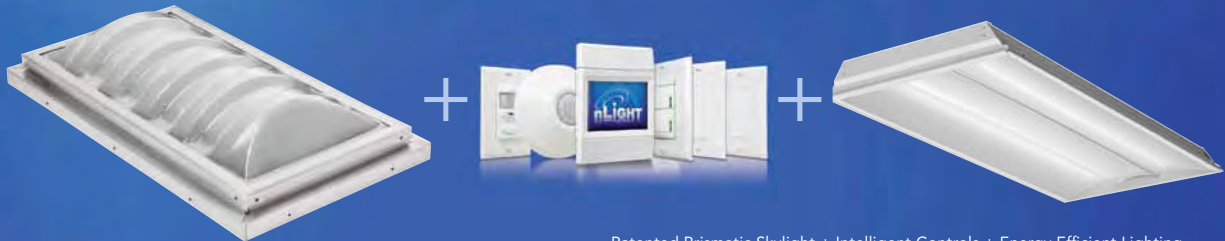
Patented Prismatic Skylight + Intelligent Controls + Energy Efficient Lighting

But, when the clouds roll in, an integrated daylighting solution can keep you out of the dark.