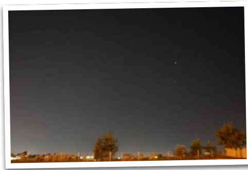
Difference of light pollution